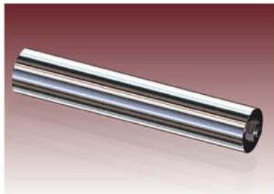
Attenuator / 蓄能器 Max Pressure 4,130bar (60,000psi)